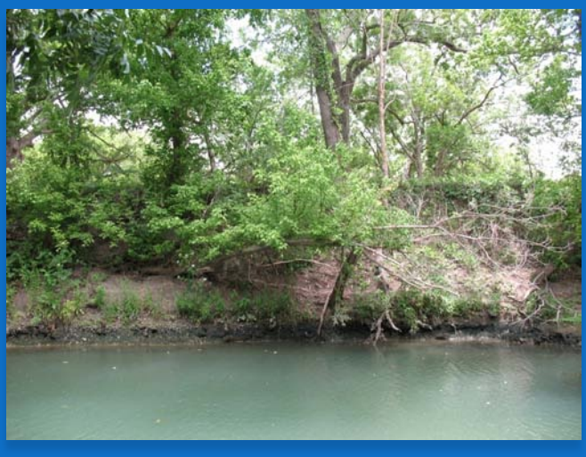
Ward Ling Texas A&M AgriLife Extension