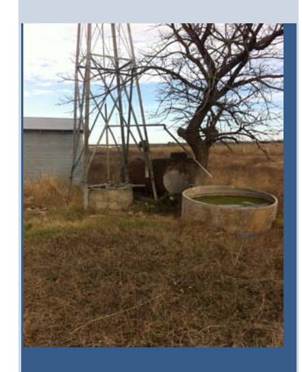
Protecting your private water well is your responsibility.