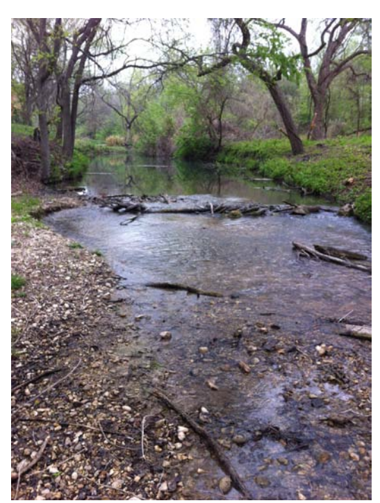
Geronimo Creek at Laubach Road near Seguin.

Through a federal Clean Water Act §319(h) grant from the Texas State Soil and Water Conservation Board, the Guadalupe-Blanco River Authority and the Texas AgriLife Extension Service are facilitating the stakeholder process for implementation of the Watershed Protection Plan.